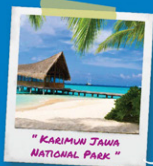
"KARIMUN JAWA NATIONAL PARK"

Situated some 90km northwest off the northern coast of Jepara Regency in Central Java Province, the Karimunjawa Archipelago is a chain of breathtaking coral-fringed islands replete with underwater splendor secluded in the open Java Sea. Here, the white beaches are sublime, swimming is wonderful, snorkeling is extraordinary, and the pace of life relaxed as a destination defined by coconut palms and turquoise seas.